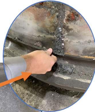
Damage to the head from burning.